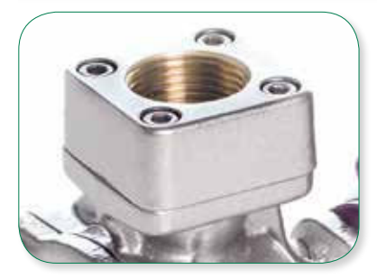
Removable ports they make it faster and easier to disassemble the pump without disconnecting it from the pipes.